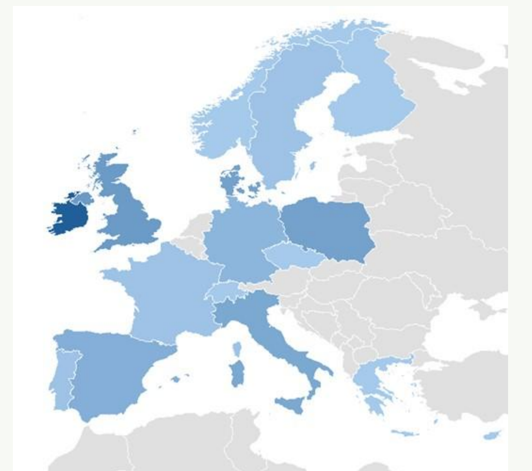
Figure 1. Heatmap of included countries