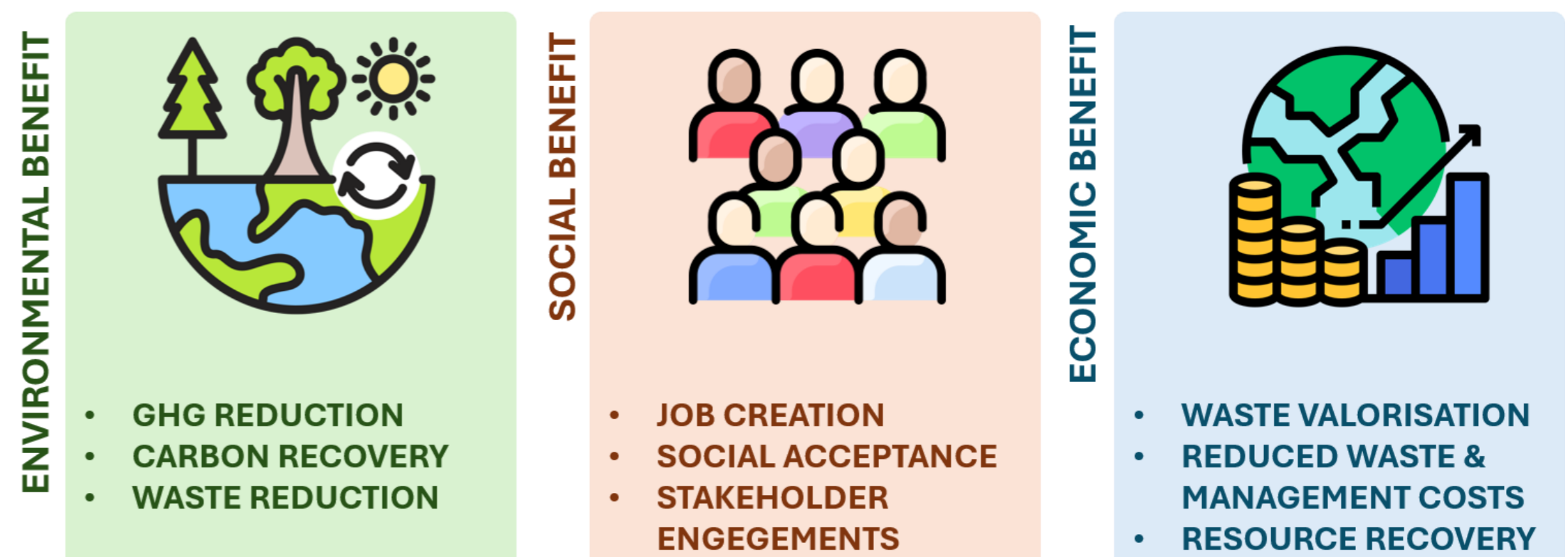
Figure 3. Expected benefit of the W2B project.