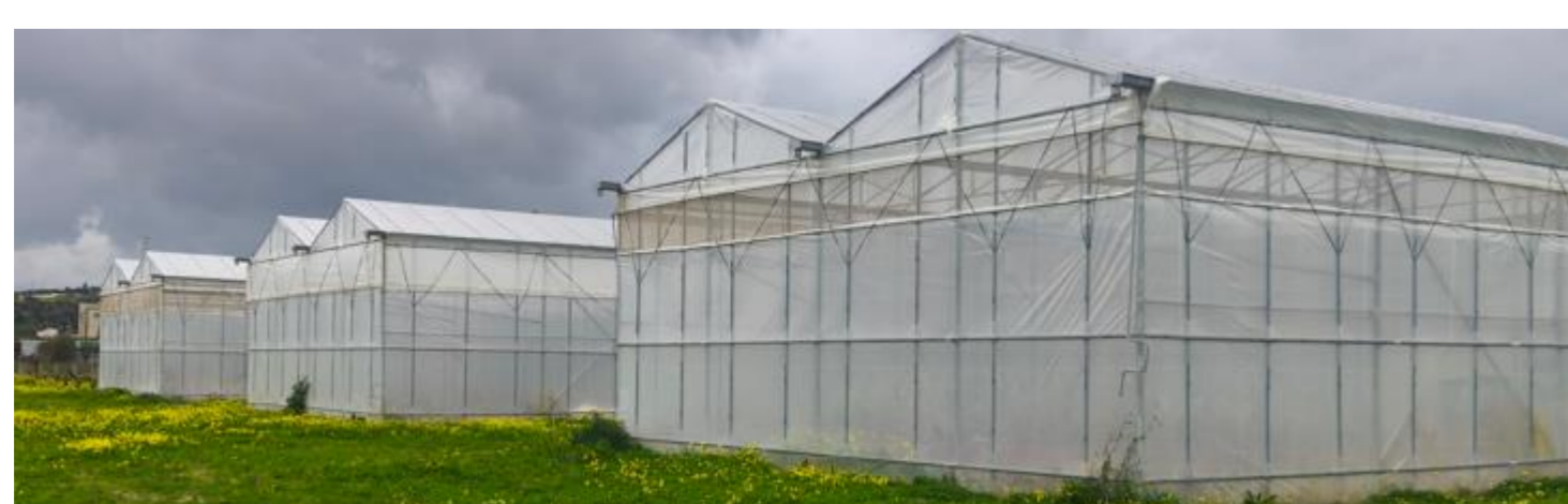
Fig 2: Three advanced greenhouses.