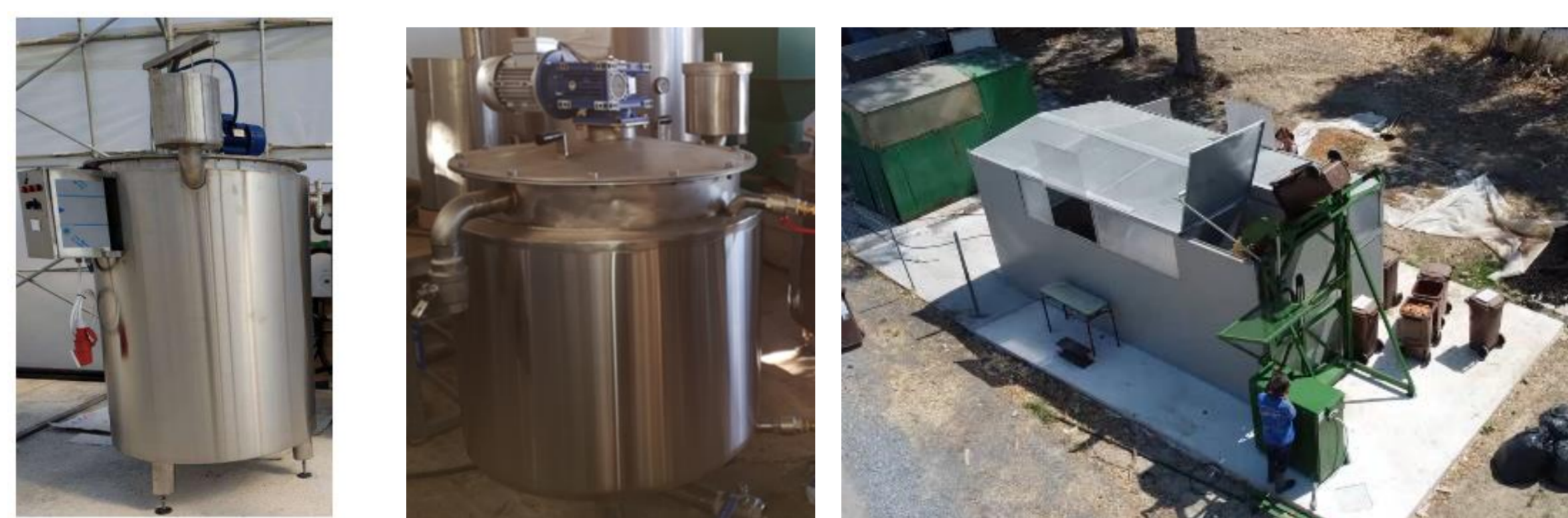
Fig 1: a) wet AD 1 m 3 , b) wet AD 220 L, c) ACU.