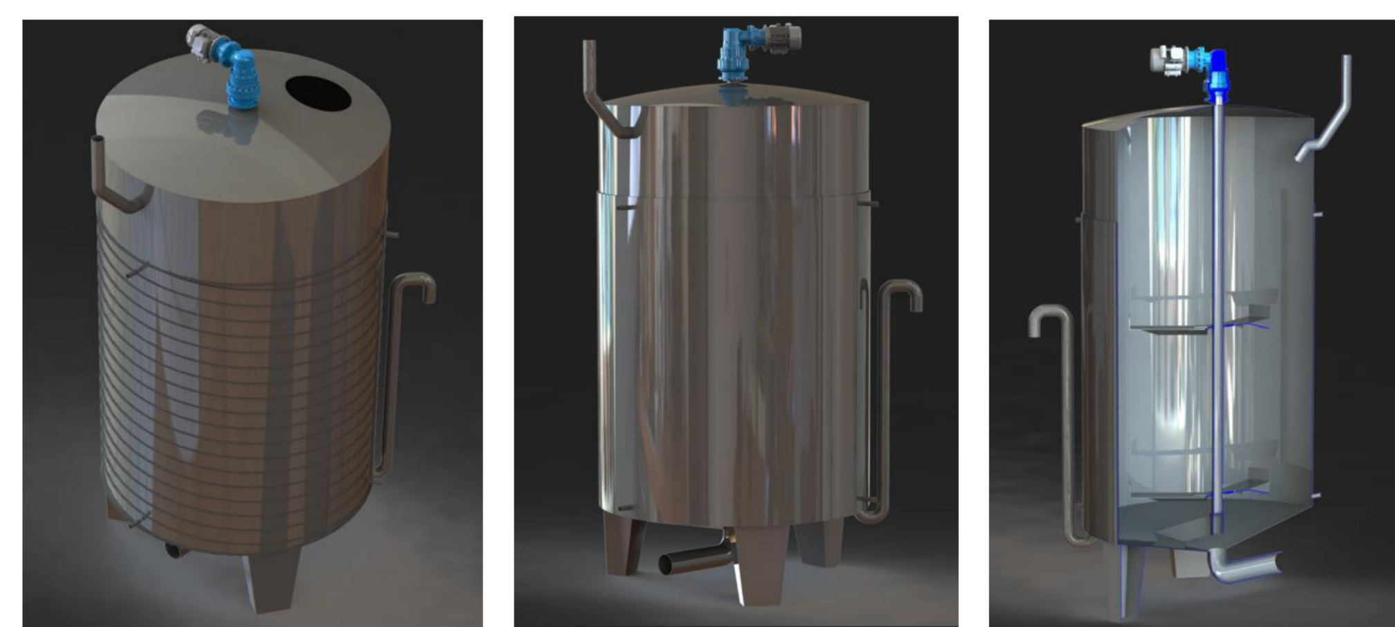
Fig 3: Wet AD 10 m 3 .

The new components include a 10 m 3 AD bioreactor, a gasification unit (50 kg/h) for syngas production, biogas and syngas storage tanks, biogas-to-biomethane and syngas-to-biomethane conversion units, an electrolyser for renewable hydrogen production, a biomethane storage and utilization system and an internal combustion unit capable of burning biogas, syngas and biomethane. A 25 kWe solar photovoltaic park with battery storage will further support the facility's renewable energy supply.